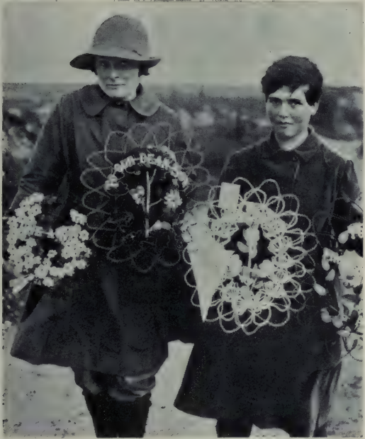
Wreaths from mothers of the fallen.